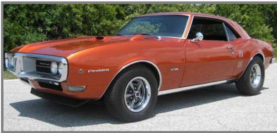
1968 Pontiac Firebird